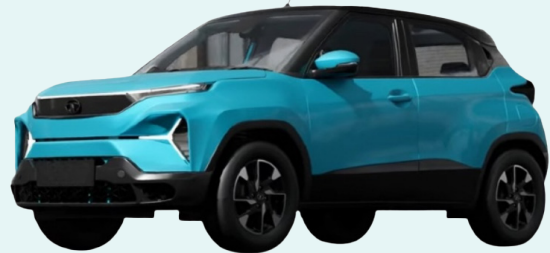
Tata Punch (Facelift)