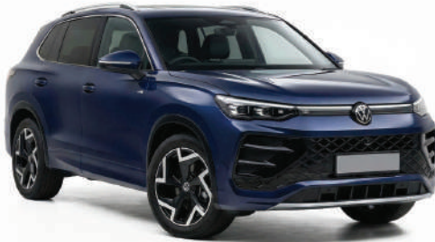
Volkswagen Tayron R-Line