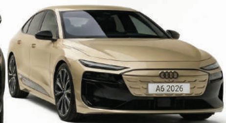
Audi A6 2026