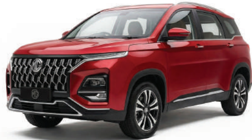
MG Hector Plus Est.