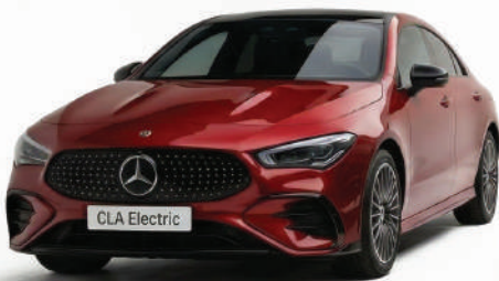
Mercedes-Benz CLA Electric