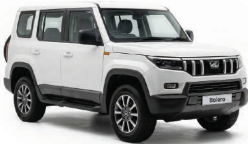
Mahindra Bolero 2026