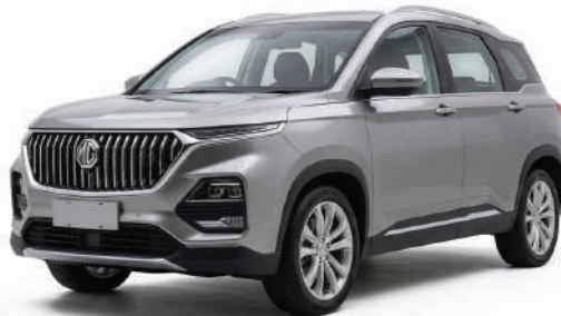
MG Hector Est.