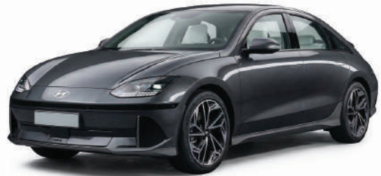
Hyundai IONIQ 6